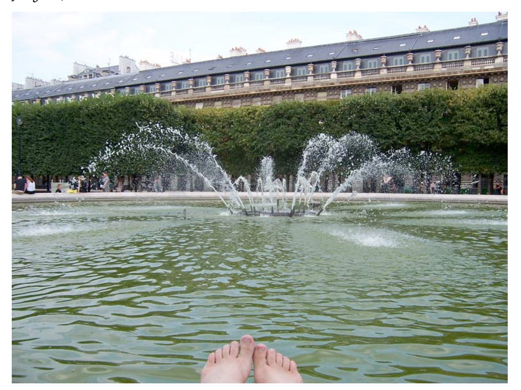
Les feets de G. au Palais Royale. Midi.