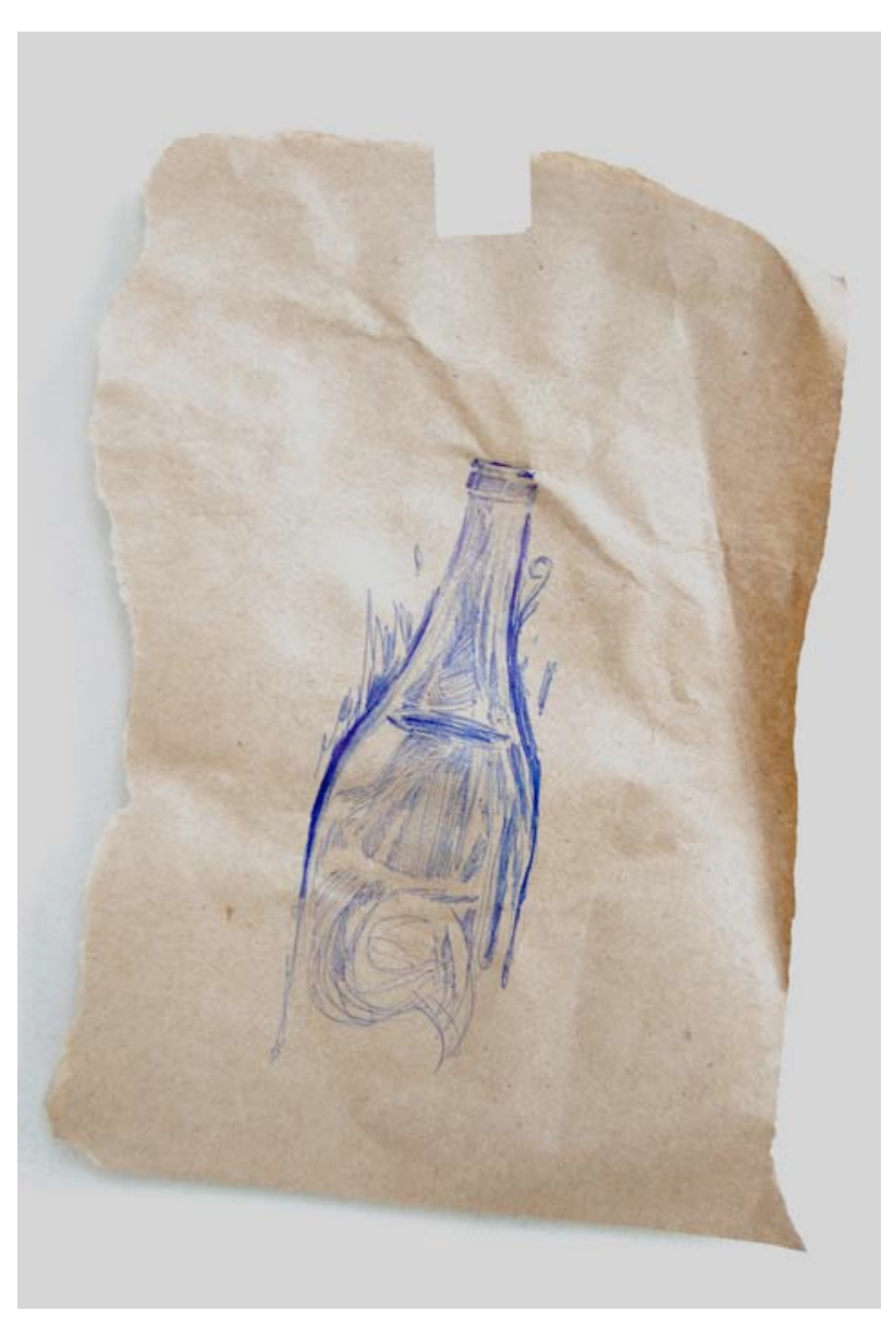
G.'s morning sketch at the café. Blue ballpoint on butcher paper.