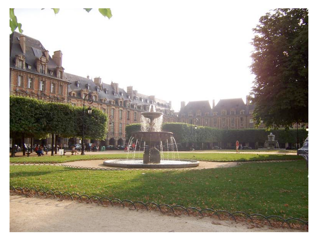
Place des Vosges, p.m.