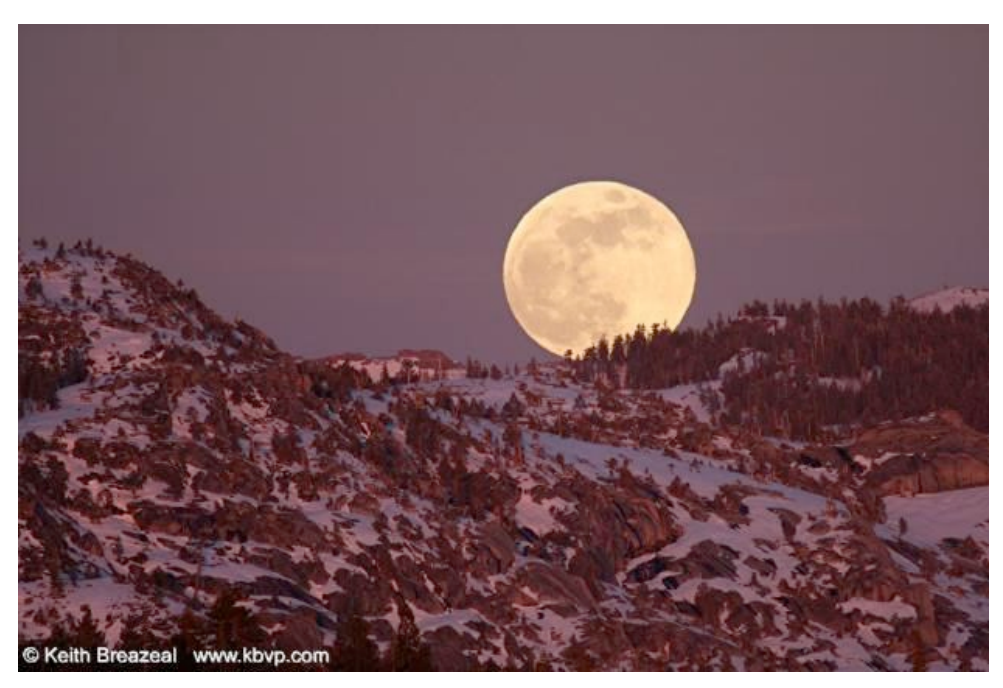
Amador County, CA

Perigee wolf moon. Big as she gets. Shadow knows.