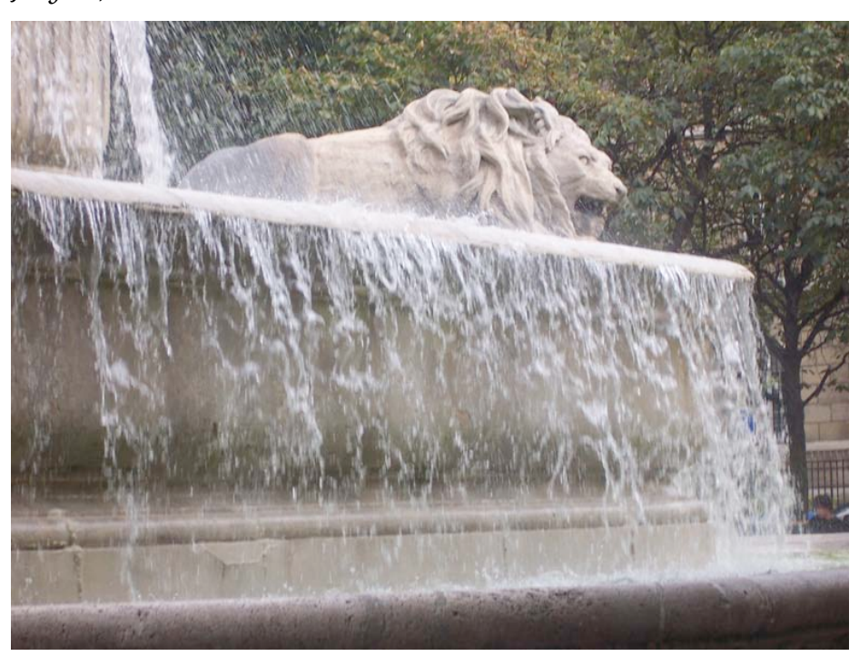
Devant de l'eglise de St-Sulpice.