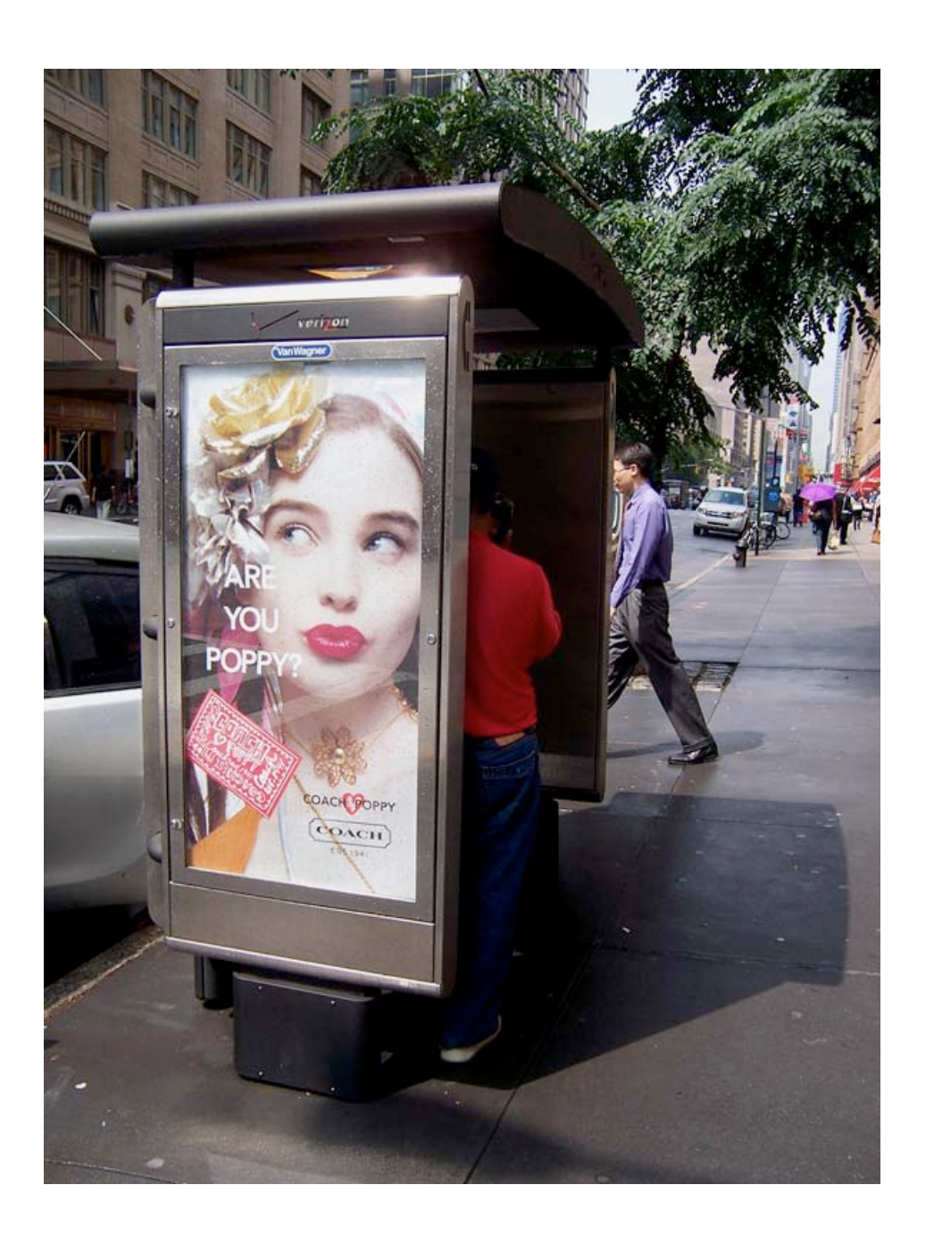
And 0 to get mung about...