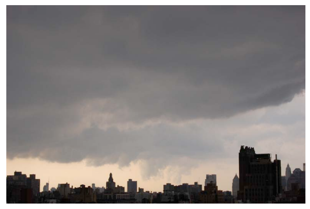
OK, Mams, you win.

You got to fight for your right – to extinction!