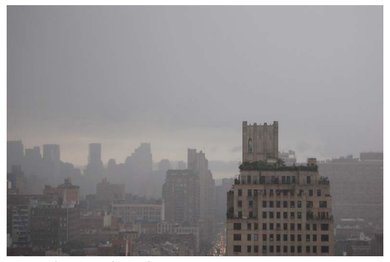
South. Five something in the p.m.