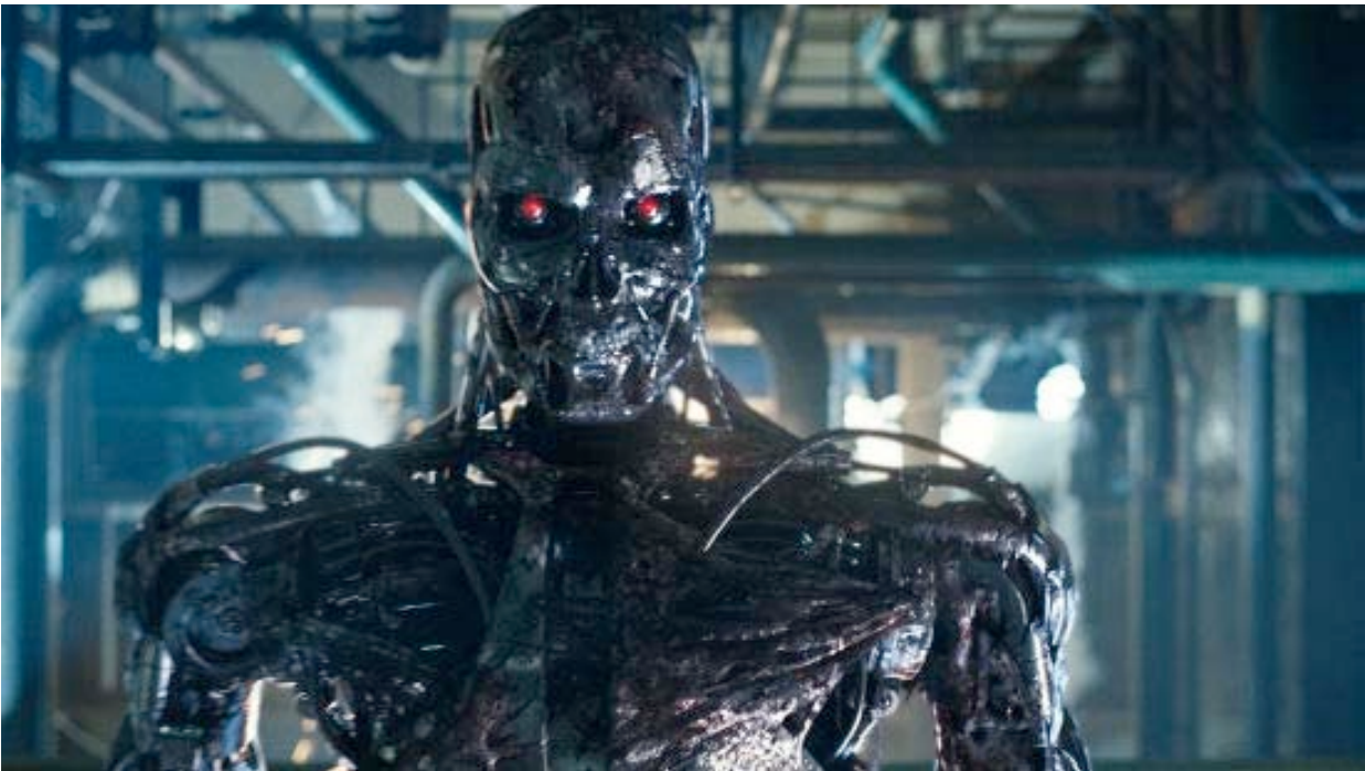
Is this the face that launched a thousand drones?