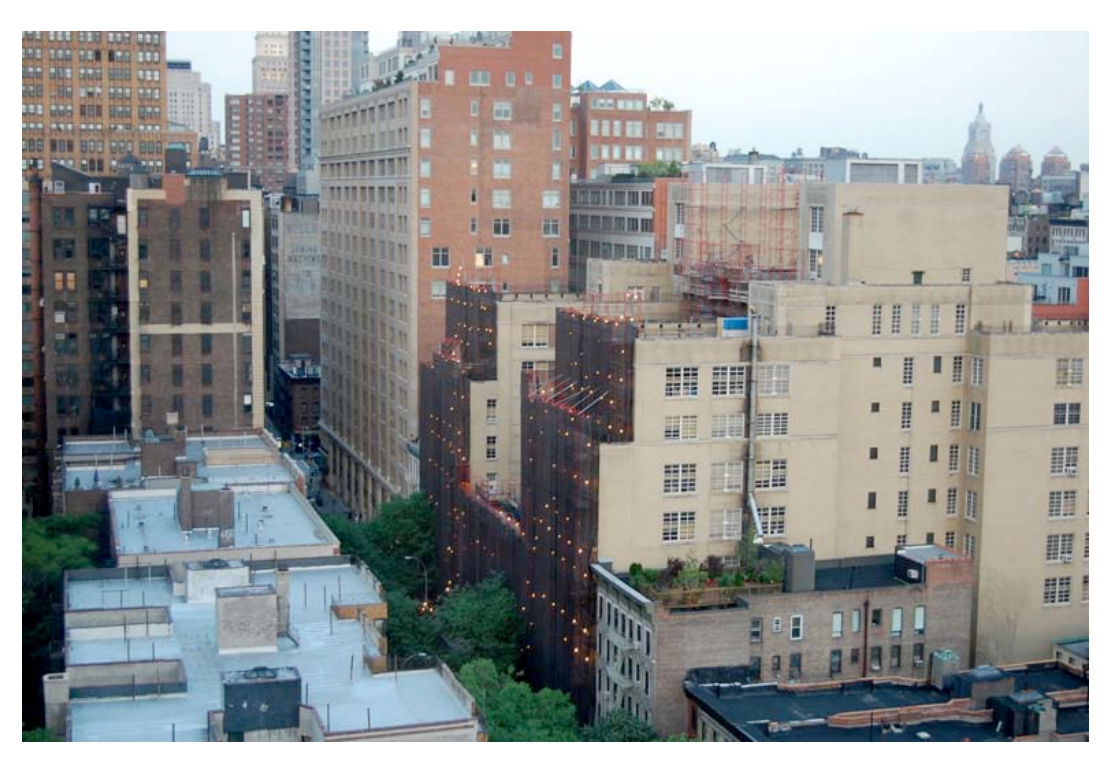
Illuminated scaffolding of Fashion High at dusk.

A young poet of your ken invented a character whose name – perhaps it's a nom de plume – is Adore Forward. And why not?