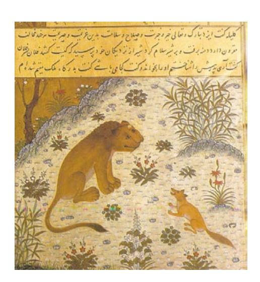
Dimna, the jackal-vizier tries to manipulate his lion-king into waging war. From

Conscientização – still not a dead letter.