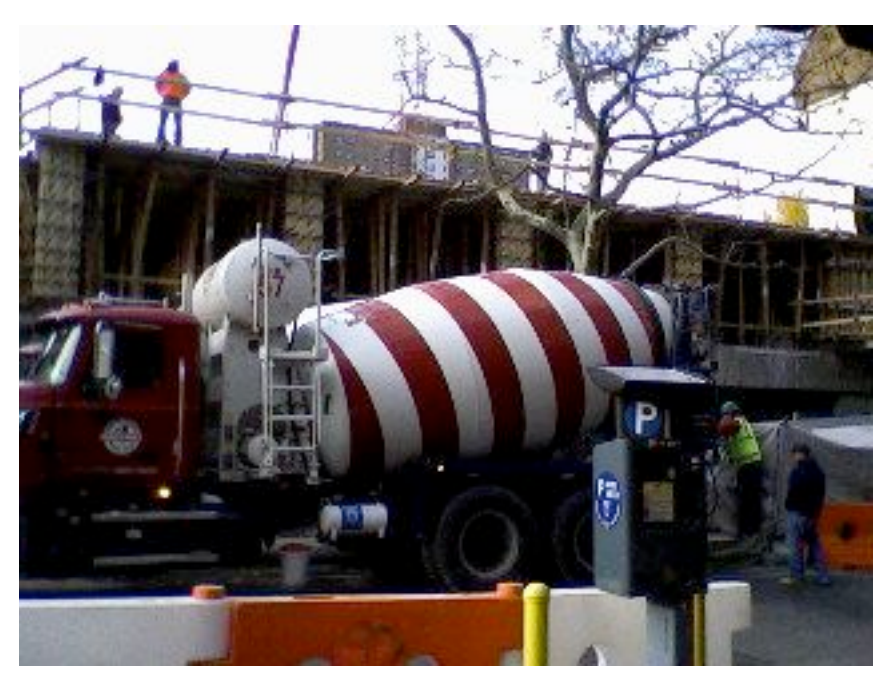
January 1, Oh, Oh, 9 Blamed. Entirely. Situation.