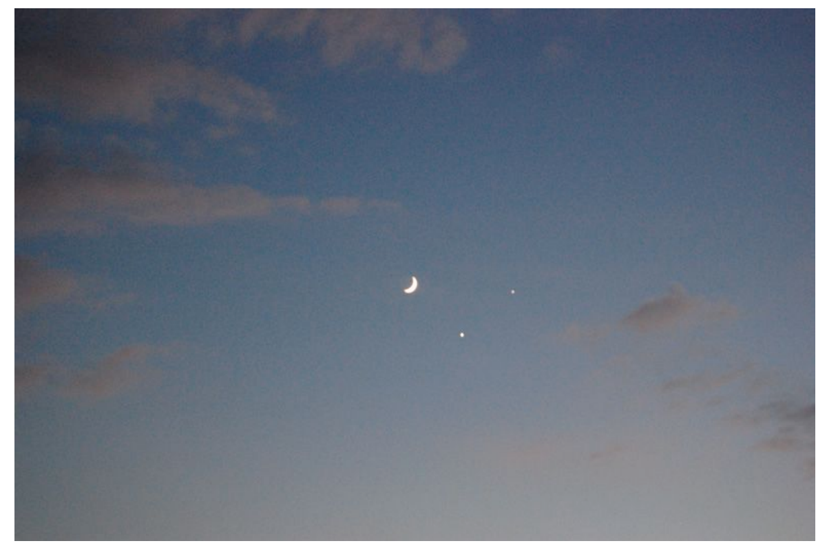
Moon, Venus, Jupiter. And Bombay, mon amour.