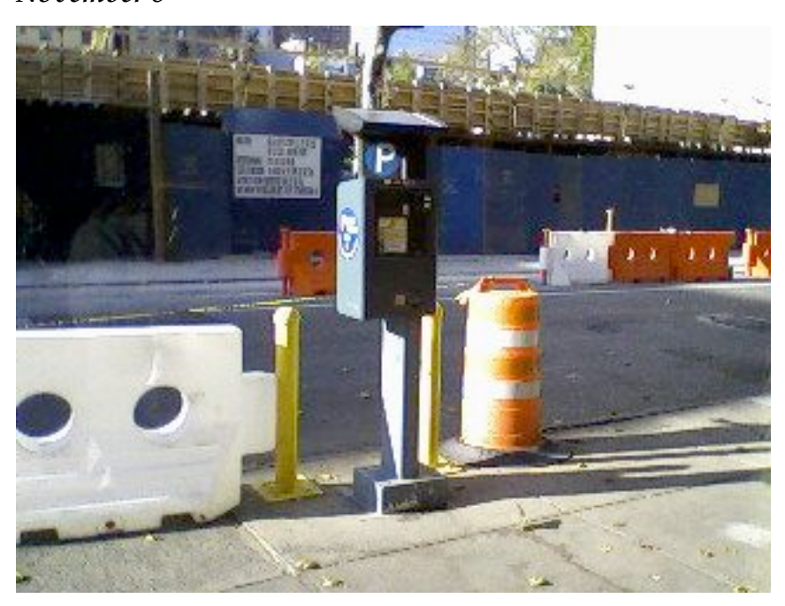
21st and Ninth.