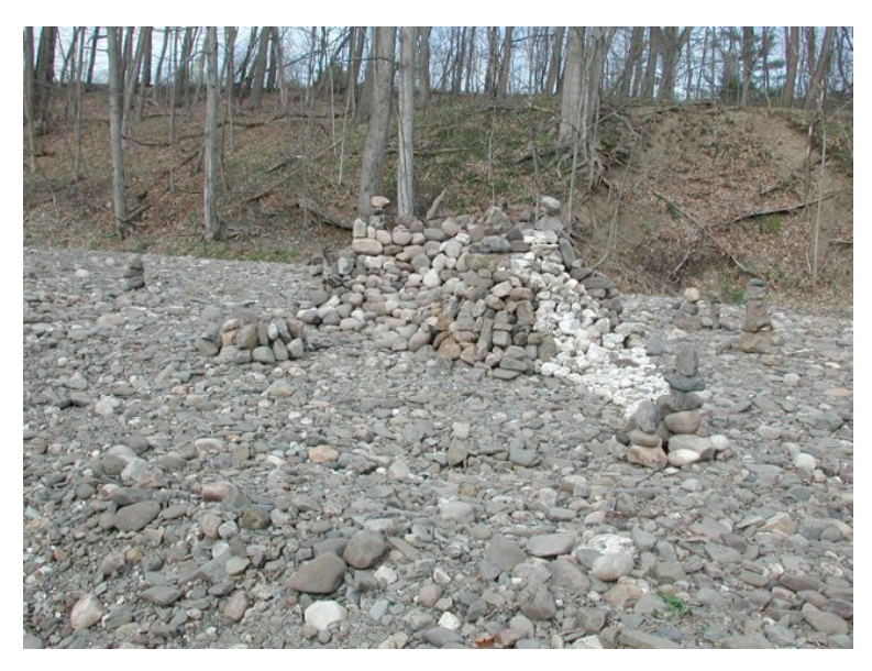
beyond each even' sun go down

could it be sovereignty spread-eagled for all to see and declared for every you and every me