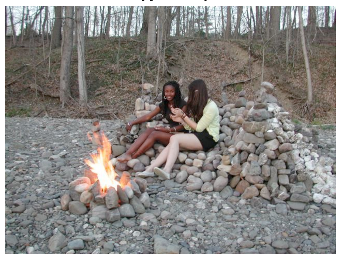
a couple of sovereigns...