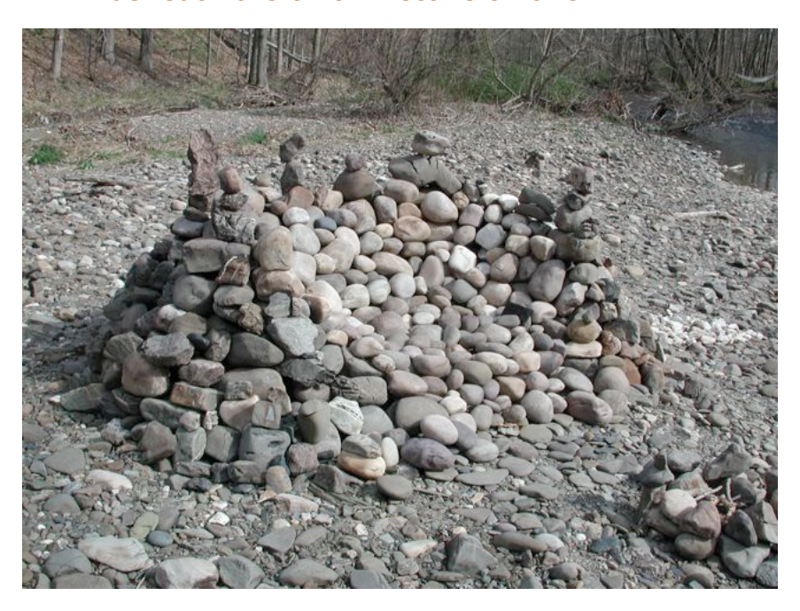
like water headed to the deep blue sea the relentless stream of time brings man, beast and humble stone to their own.....