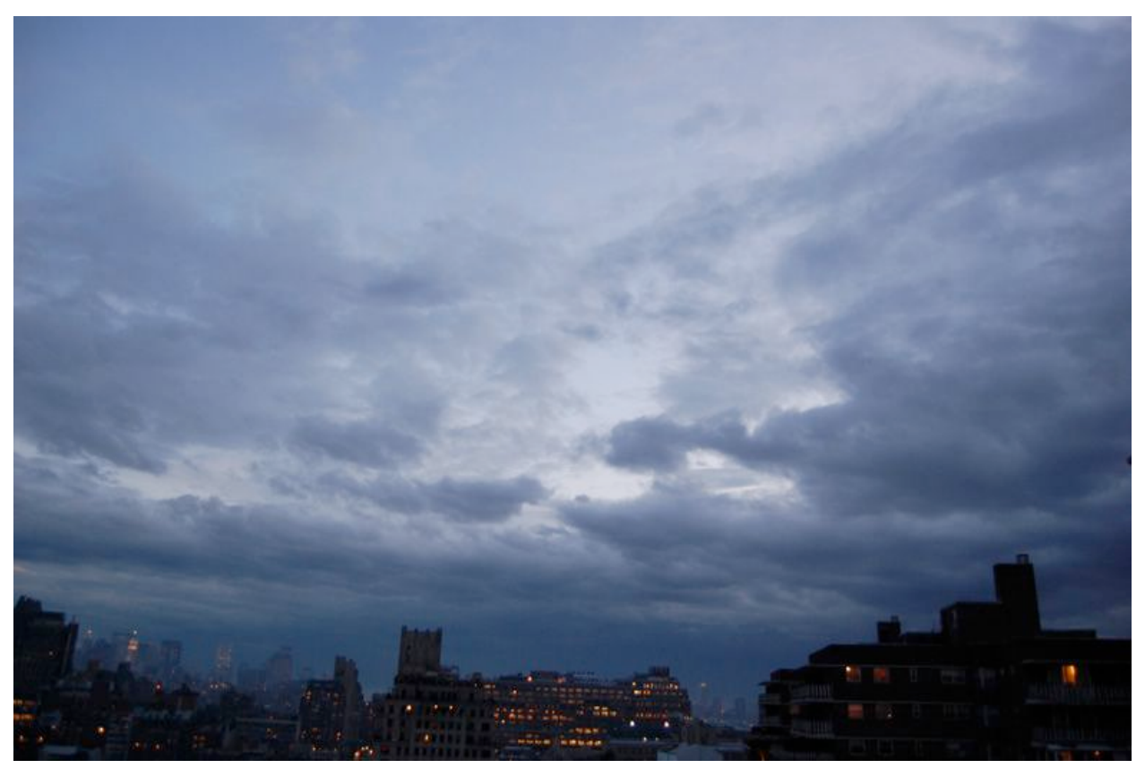
And then, there are messages in the sky that the city cannot bear to hear.