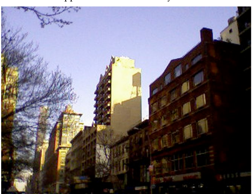
The shadow knows.