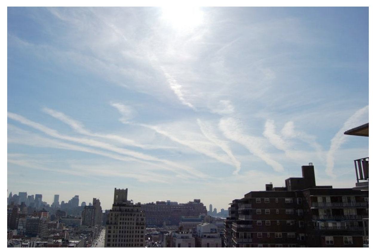
Helter skelter gimme shelter.