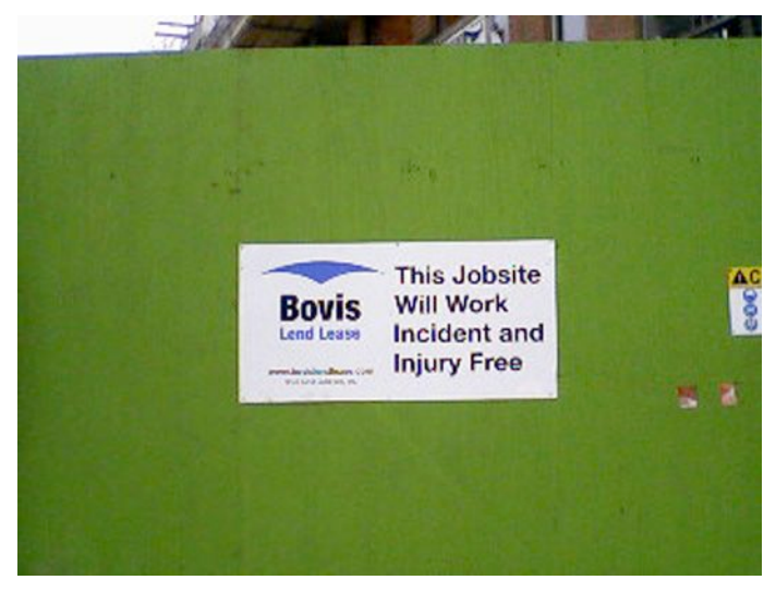
Hoardings around the new Seminary building at 20th and Ninth. The Chelsea