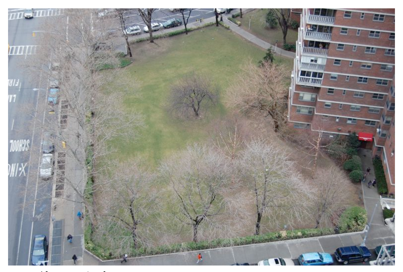
Almost spring lawn.