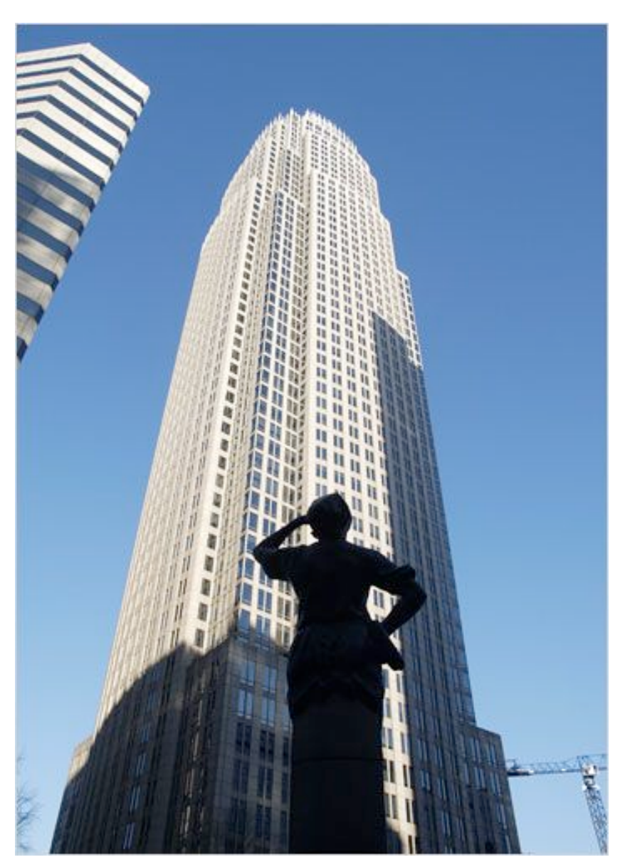
Bank of Nomerica's HQ in Charlotte, NC.

In Asia particularly, the indexes come roaring back to death. And ah, the ever expanding necronomy.