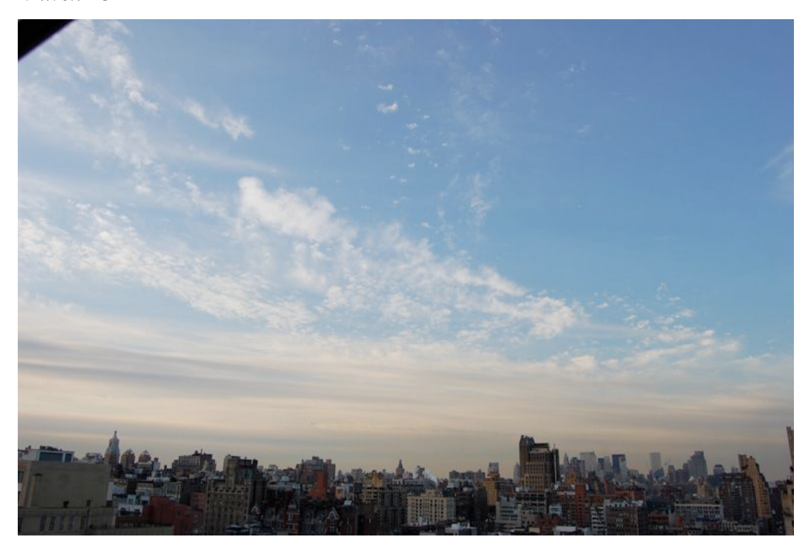
Early a.m. SSE.