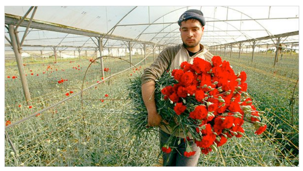
February 12 Israel Opens Gaza Border for 25,000 Carnations, Bound for Europe