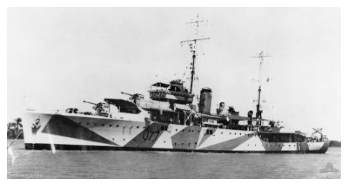
HMAS Yarra, sunk by a Japanese cruiser force whilst escorting a convoy near Java in 1942.

Dazzle camouflage, or razzle-dazzle they called it. Used on certain large WWI and WWII-era warships. The idea, purportedly dreamed up by an English artist, Norman Wilkenson – later Sir – not for concealing a ship by blending it into its surroundings, but rather confounding the eye of the beholder as well as the range finders used for naval artillery. Dazzle also made it difficult for observers to tell the ship's speed and heading. Where exactly was the stern and where the bow? In short, WTF am I s'posed to shoot at?