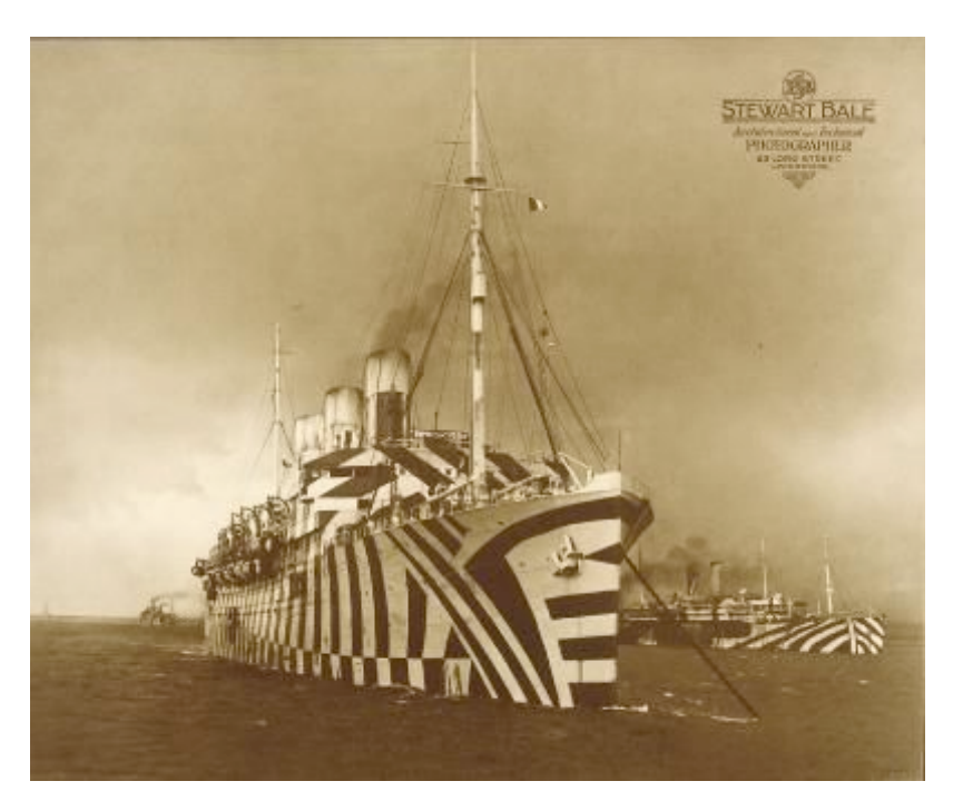
The troopship SS Empress of Russia, 1918.

One way to pose the question is: how to step down from Empire? Another much deeper one concerns how we de-exceptionalize ourselves, internally.