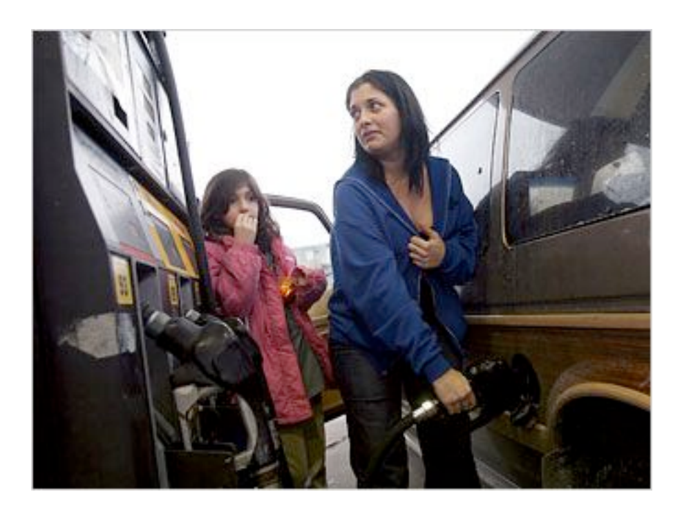
David Ahntholz for The New York Times

Beneath which, the Messenger 's caption runs: "Consumers are being hit hard as the oil shock coincides with credit and housing market turmoil." But that's not at all what the picture is about.